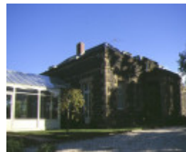
Barwon Bank Riversdale Rd Marnock Vale Newtown Additions 1997