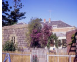
barwon bank riversdale road marnock vale newtown west elevations she project 2004