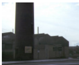
shot tower alexandra parade clifton hill front view