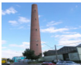
SHOT TOWER SOHE 2008