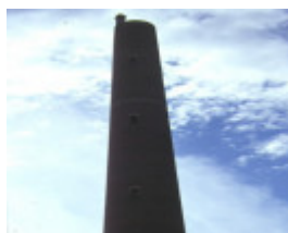
1 shot tower alexandra parade clifton hill tower view