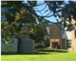
MacRobertson Girls' High School May 2020