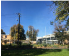
MacRobertson Girls' High School May 2020