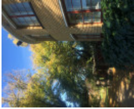
MacRobertson Girls' High School May 2020