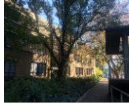
MacRobertson Girls' High School May 2020