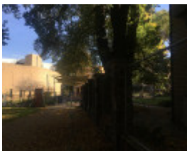
MacRobertson Girls' High School May 2020