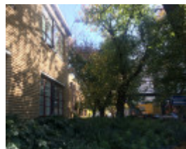
MacRobertson Girls' High School May 2020