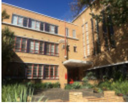
MacRobertson Girls' High School May 2020