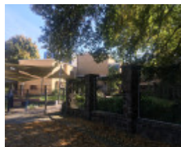
MacRobertson Girls' High School May 2020