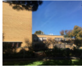
MacRobertson Girls' High School May 2020