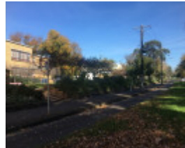
MacRobertson Girls' High School May 2020