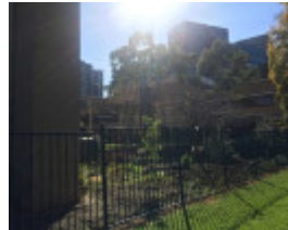
MacRobertson Girls' High School May 2020