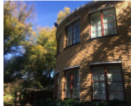
MacRobertson Girls' High School May 2020