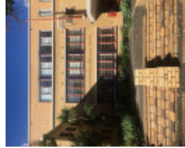
MacRobertson Girls' High School May 2020