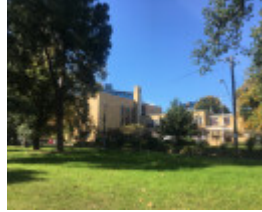
MacRobertson Girls' High School May 2020