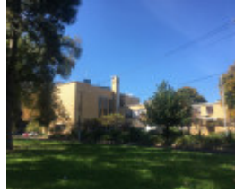
MacRobertson Girls' High School May 2020