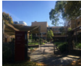
MacRobertson Girls' High School May 2020