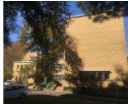
MacRobertson Girls' High School May 2020