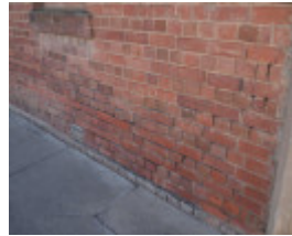
H1072 ECHUCA FLOUR MILL LHA 2015 3.JPG