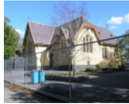
PRIMARY SCHOOL NO. 1252 SOHE 2008