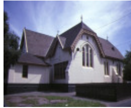
1 primary school number 1252 lee street carlton north side elevation feb1985