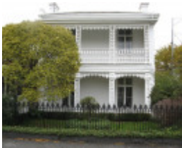
104 Gipps St_E Melb_KJ_11 June 09