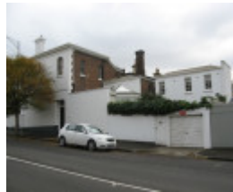
104 Gipps St_E Melb_rear_KJ_11 June 09