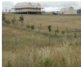
Dry Stone Wall S282