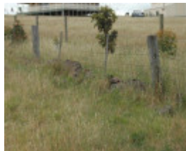
Dry Stone Wall S282