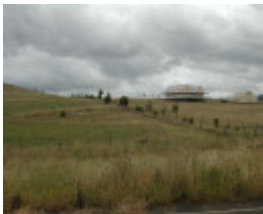
Dry Stone Wall S282