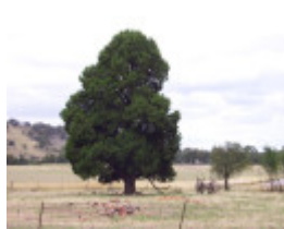
Relics of the former homestead - house burnt down in 1965