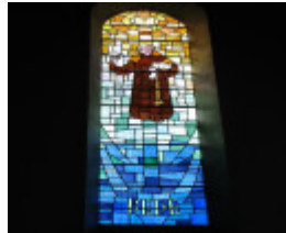
H2158 clerestory sth bede stansfield 1968