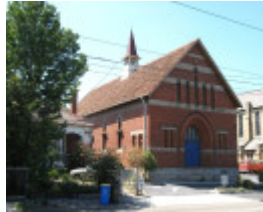
H2158 brooksbank hall from burke road