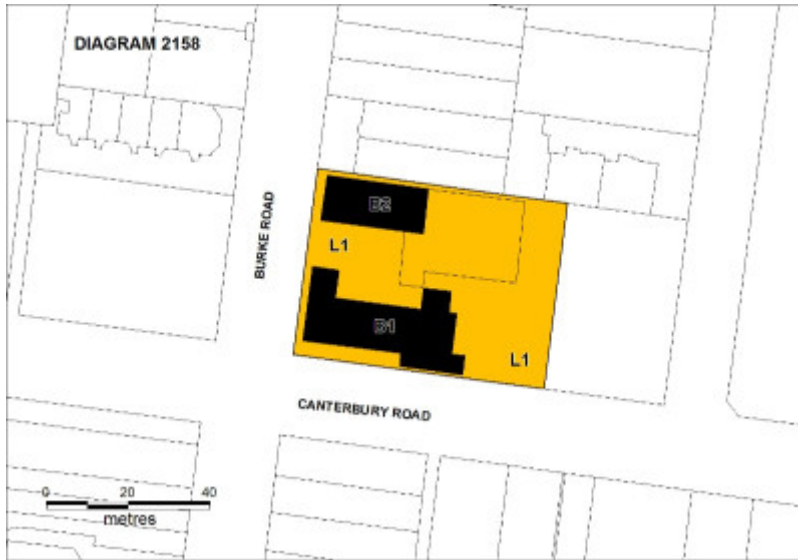
H2158 ST MARKS