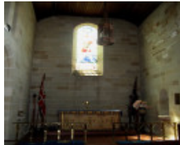
H2158 chapel st george window war memorial