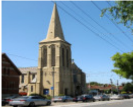
H2158 St Mark s Church from Burke Rd