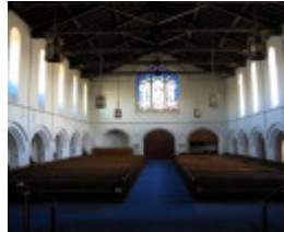
H2158 nave from choir