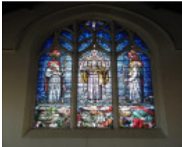
H2158 west window transfiguration n waller 1952