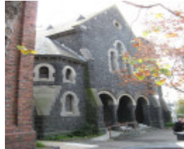
Church of All Nations_Carlton_KJ_6 June 08