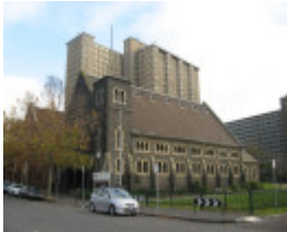
Church of All Nations Carlton_KJ_6 June 08