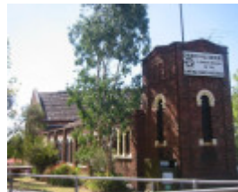
Church of All Nations_mission hall_KJ_6 June 08