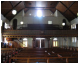
Church of All Nations_rear gallery_KJ_6 June 08