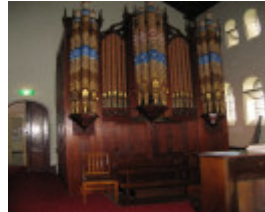
Church of All Nations_Carlton_Fincham organ_KJ_6 June 08