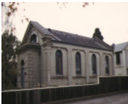
h01103 former synagogue yarra street geelong side view