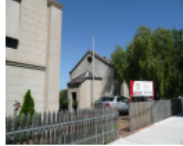
FORMER SYNAGOGUE SOHE 2008