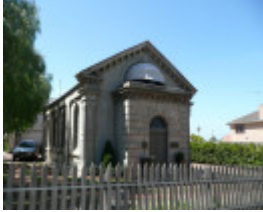
FORMER SYNAGOGUE SOHE 2008