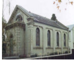
h01103 1 former synagogue yarra street geelong front corner elevation publication