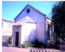
Former Synagogue McKillip St Geelong Exterior North East Corner SHE Project 2003