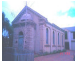
Former Synagogue McKillip St Geelong Exterior View West SHE Project 2003