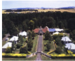
Rockbank Beam Wireless Station