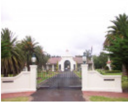
Former Wireless Beam Station