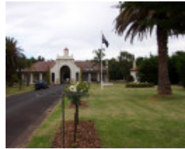
Former Wireless Beam Station