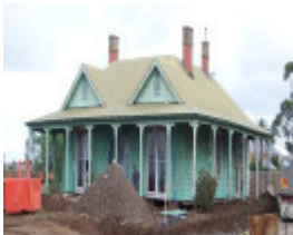
Homestead - April 2010