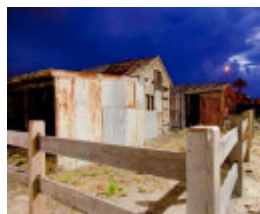
Dairy Buildings - 2011