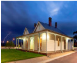
Morton Homestead 2011