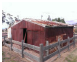
Dairy Buildings - May 2013