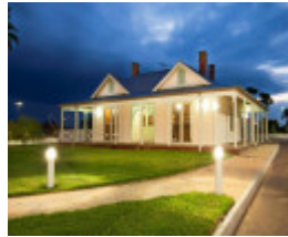
Homestead - 2011