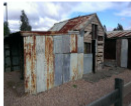
Dairy Buildings - May 2013