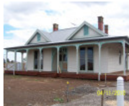
Homestead - November 2010