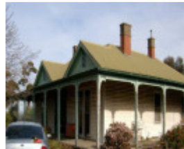
Homestead - 2005