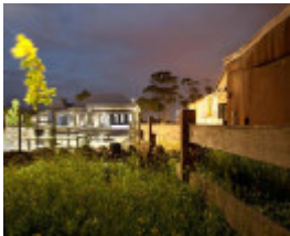
Morton Homestead 2011