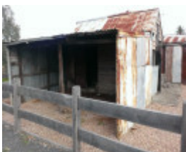
Dairy Buildings - May 2013