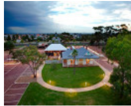
Morton Homestead 2011