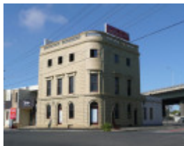
BAY VIEW HOTEL SOHE 2008