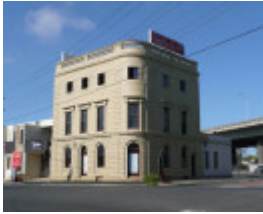
BAY VIEW HOTEL SOHE 2008