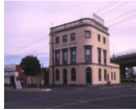
1 bay view hotel mercer street geelong front corner view aug1995