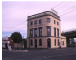
1 bay view hotel mercer street geelong front corner view aug1995