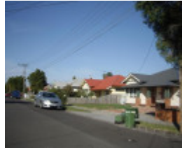
HO12(3) - War Service Homes, Heritage Area, Maribyrnong.JPG