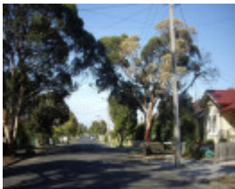
HO12(1) - War Service Homes, Heritage Area, Maribyrnong.JPG