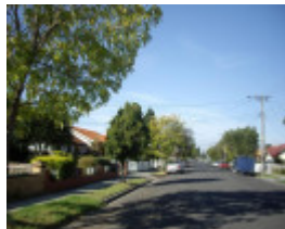
HO12(4) - War Service Homes, Heritage Area, Maribyrnong.JPG