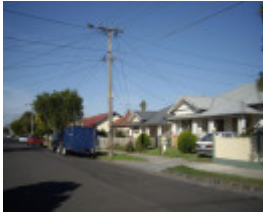
HO12(5) - War Service Homes, Heritage Area, Maribyrnong.JPG