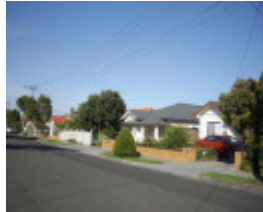
HO12(2) - War Service Homes, Heritage Area, Maribyrnong.JPG