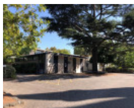
603 Toorak Road, Toorak