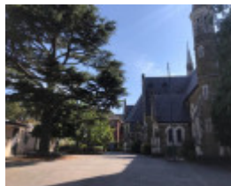
603 Toorak Road, Toorak