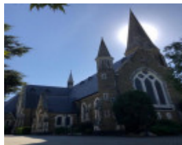
603 Toorak Road, Toorak