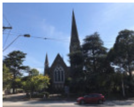
603 Toorak Road, Toorak