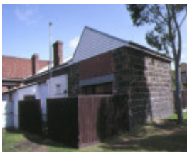
holy trinity anglican church complex sydney road coburg school rear view aug1992