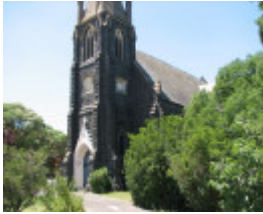
HOLY TRINITY ANGLICAN CHURCH COMPLEX SOHE 2008