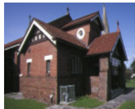
holy trinity anglican church complex sydney road coburg view of church hall aug1992