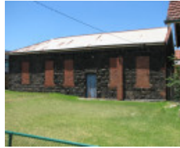
HOLY TRINITY ANGLICAN CHURCH COMPLEX SOHE 2008