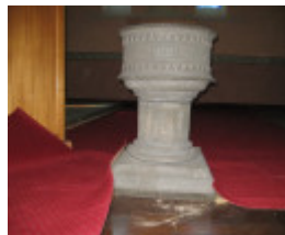
H0959 Holy Trinity Coburg 9 Nov 2009 023.jpg