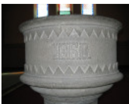
H0959 Holy Trinity Coburg 9 Nov 2009 024.jpg