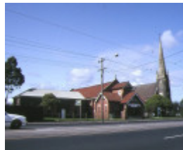
holy trinity anglican church complex sydney road coburg property view of church aug1992