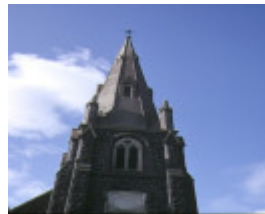
holy trinity anglican church complex sydney road coburg spire detail aug1992