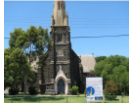
HOLY TRINITY ANGLICAN CHURCH COMPLEX SOHE 2008