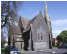
1 holy trinity anglican church complex sydney road coburg side view of church aug1992