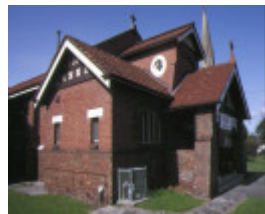
holy trinity anglican church complex sydney road coburg view of church hall aug1992