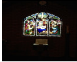
St Paul's Church of England