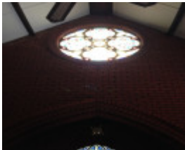
St Paul's Church of England