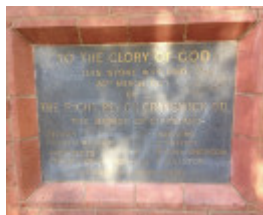
St Paul's Church of England