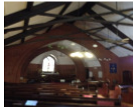
St Paul's Church of England