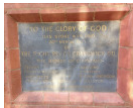
St Paul's Church of England