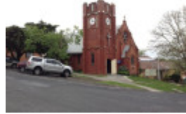
St Paul's Church of England