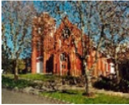
St. Paul's Church of England