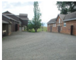
YERINGBERG SOHE 2008