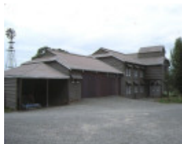
1 yeringberg maroondah hwy coldstream view of winery dec1987