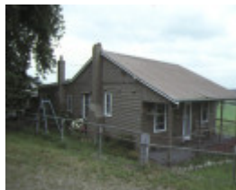
yeringberg maroondah hwy coldstream cottage view dec1987