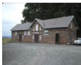
yeringberg maroondah hwy coldstream stables front view dec1987