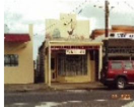
Shop, 86 Ridgway (2000)