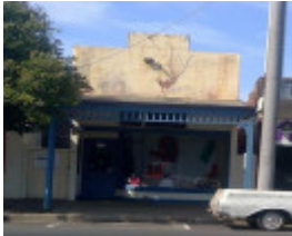
Shop - 86 Ridgway (2020)