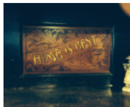
Dorfstedt interior - living room fireplace motto 2 (2015)