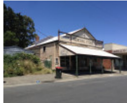
Poowong Pioneer Store