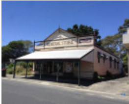
Poowong Pioneer Store