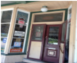
Poowong Pioneer Store