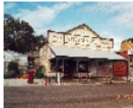
Poowong Pioneer Store