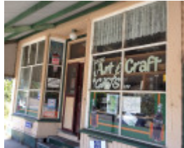
Poowong Pioneer Store