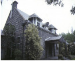
1 manor house eldon street broadmeadows front view