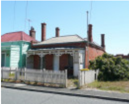
ST ELMO SOHE 2008