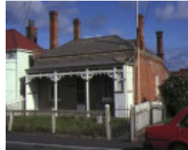
1 st elmo elizabeth street geelong front view apr1995