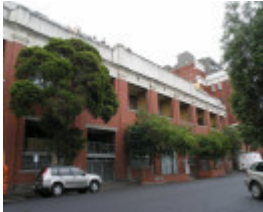
PART OF FORMER FOY AND GIBSON COMPLEX SOHE 2008