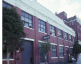
foy & gibson complex oxford street collingwood front sign