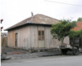
SINGAPORE COTTAGE SOHE 2008