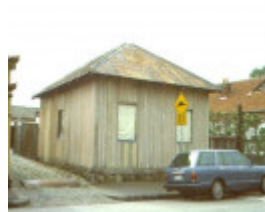
1 singapore cottage sackville street h610 june 2001