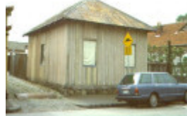
1 singapore cottage sackville street h610 june 2001