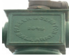
Detail of Standpipe Haddon