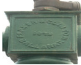
Detail of Standpipe Haddon