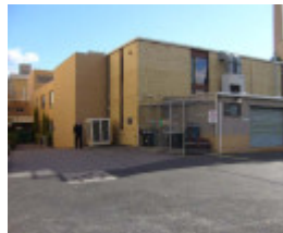
Engineering Building 1967