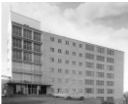
East Wing 1958