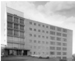
East Wing 1958