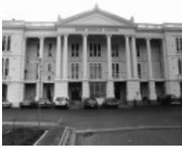
Anne Caudle Centre, formerly Bendigo Benevolent Asylum, Barnard Street