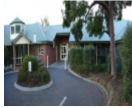
Streams of Care Marjorie Phillips Unit 1998