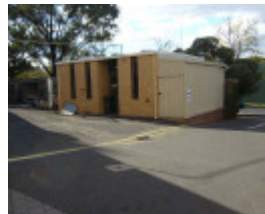
Electrical workshop 1984