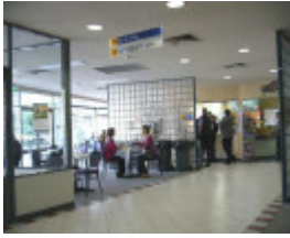
Perrin Plaza 1992