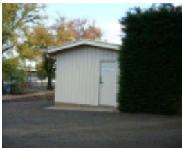
Gardeners Shed post 1950