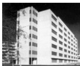
North Wing 1973-74