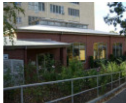
Hydrotherapy Unit 1993