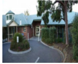
Streams of Care Marjorie Phillips Unit 1998