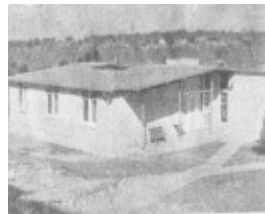
HART former Nurses Quarters 1958