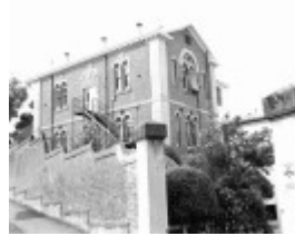
Nurses home, Anne Caudle Centre