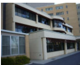
John Lindell Rehabilitation Unit 1999