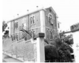
Nurses home, Anne Caudle Centre