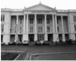
Anne Caudle Centre, formerly Bendigo Benevolent Asylum, Barnard Street