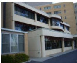
John Lindell Rehabilitation Unit 1999