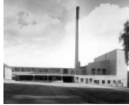
Boiler House and Laundry 1956