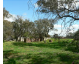
Williams Fancy Co opp 15 Sykes Rd Berringa