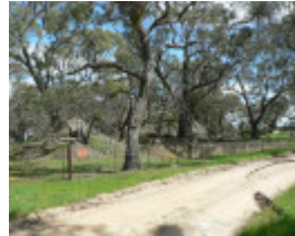
Williams Fancy Co, Mullock Heaps opp 15 Sykes Rd Berringa