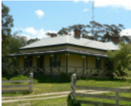
Former Mine Manager's Residence 15 Sykes Rd Berringa