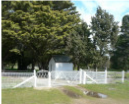
Front gates, Cape Clear Cemetery