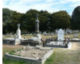
Cape Clear Cemetery, view over gravestones looking to the west.