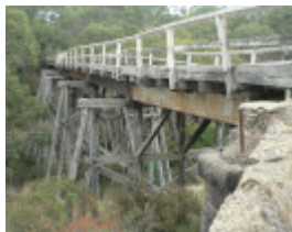
Detail of Springdallah Bridge Linton Pigoreet Road