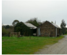
Piggoreet West Homestead Stables & Barn east