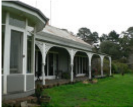
Piggoreet West Homestead viewed from the south east