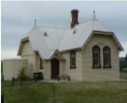
Former Garibaldi School, Hardies Hill Road