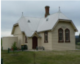
Former Garibaldi School, Hardies Hill Road