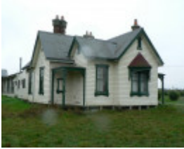
Former Napoleons Police Station and Residence