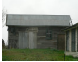
Former Napoleons Police Station and Residence - stables at rear.