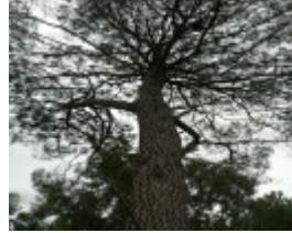
Pinus located within Staffordshire Reef Cemetery Donald McLeans Rd