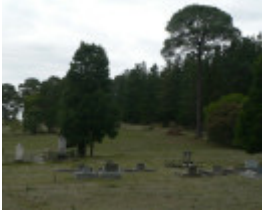
Staffordshire Reef Cemetery Donald McLeans Rd (view looking east)