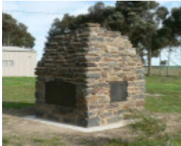
WW1 and WW2 Memorial Wallinduc