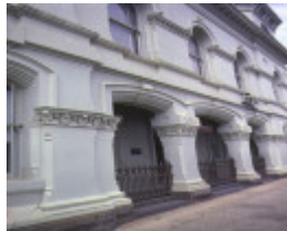
creswick town hall & offices detail town hall facade