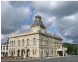
CRESWICK TOWN HALL AND FORMER MUNICIPAL OFFICES SOHE 2008