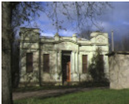
creswick town hall & offices creswick shire offices aug1985