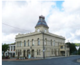
CRESWICK TOWN HALL AND FORMER MUNICIPAL OFFICES SOHE 2008