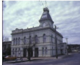
1 creswick town hall & offices front view town hall oct1982