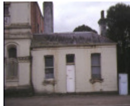
creswick town hall & offices detail town hall office exterior