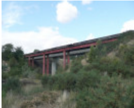
RAIL BRIDGE SOHE 2008