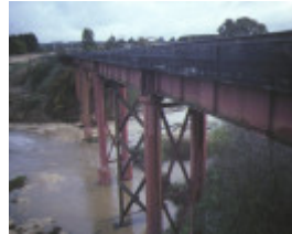
1 rail bridge creswick creek side view may1995