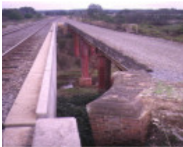
rail bridge creswick creek top view may1995