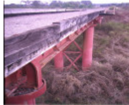
rail bridge creswick creek siding detail may1995