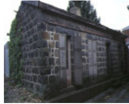
1 former creswick gold office front view