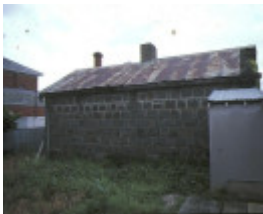
former creswick gold office rear view dec1982