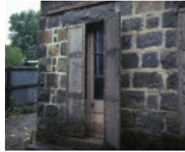
former creswick bluestone gold office detail iron shutters on window dec1982