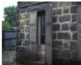
former creswick bluestone gold office detail iron shutters on window dec1982