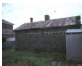
former creswick gold office rear view dec1982