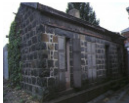
1 former creswick gold office front view