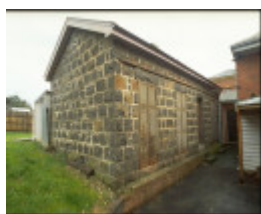
h00595 former creswick gold office aug1995