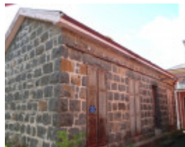
FORMER CRESWICK GOLD OFFICE SOHE 2008