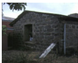
former creswick gold office side view dec1982