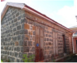
FORMER CRESWICK GOLD OFFICE SOHE 2008