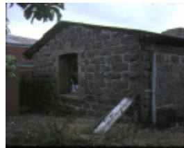
former creswick gold office side view dec1982