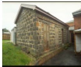
h00595 former creswick gold office aug1995