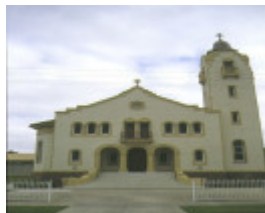
1 holy spirit church bostock avenue manifold heights front view apr1997