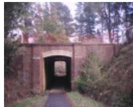
creswick railway complex pedestrian subway may1995