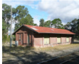
CRESWICK RAILWAY STATION COMPLEX SOHE 2008