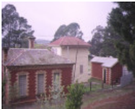
creswick railway complex rear view may1995