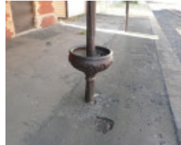
CRESWICK RAILWAY STATION COMPLEX SOHE 2008