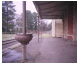
creswick railway complex platform may1995