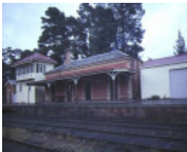
1 creswick railway complex trackside view sep1984