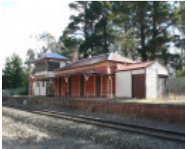
CRESWICK RAILWAY STATION COMPLEX SOHE 2008