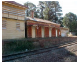
Creswick Railway Complex Signal Box