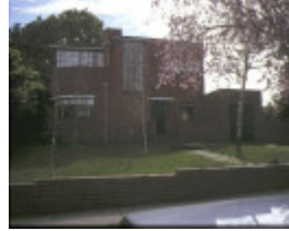
1 residence 2 riverview road essendon front view