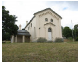
Court house front view. Feb 2008.