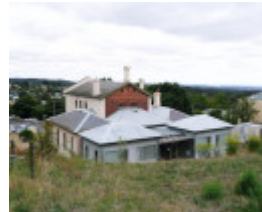
COURT HOUSE, FORMER POLICE QUARTERS AND LOCK-UP SOHE 2008