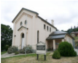
COURT HOUSE, FORMER POLICE QUARTERS AND LOCK-UP SOHE 2008