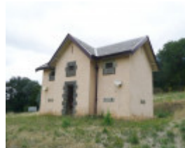
COURT HOUSE, FORMER POLICE QUARTERS AND LOCK-UP SOHE 2008