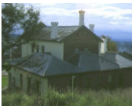
daylesford court house rear elevation jan1983