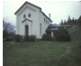
1 daylesford court house front elevation aug1983