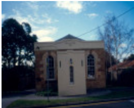
H02010 former weslyan chapel box hill front