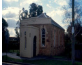
H02010 1former weslyan chapel box hill