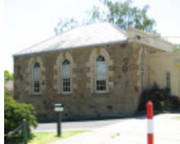
FORMER WESLEYAN CHAPEL SOHE 2008