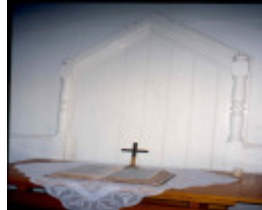
H02010 former weslyan chapel box hill interior