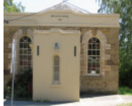
FORMER WESLEYAN CHAPEL SOHE 2008