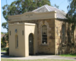
FORMER WESLEYAN CHAPEL SOHE 2008