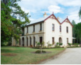
CAMPASPE PARK SOHE 2008