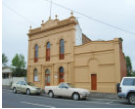
FORMER CHARLIE NAPIER HOTEL SOHE 2008