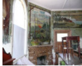
FORMER CHARLIE NAPIER HOTEL SOHE 2008