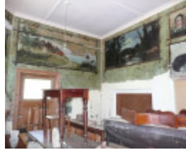
FORMER CHARLIE NAPIER HOTEL SOHE 2008