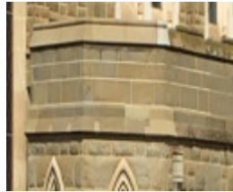
Before and After Photograph - Reference F3890 2015