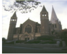
1 sacred heart cathedral bendigo front view apr1997