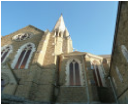
Before Photograph - Reference F3890 2014