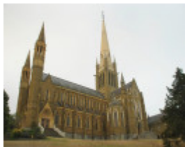
SACRED HEART CATHEDRAL SOHE 2008