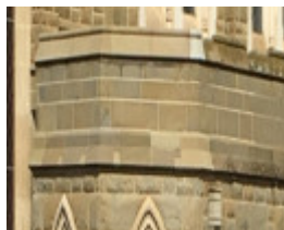
Before and After Photograph - Reference F3890 2015