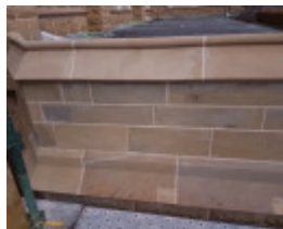
After Photograph - Reference F3890 2016