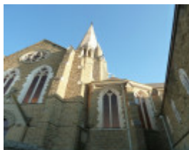
Before Photograph - Reference F3890 2014