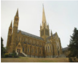
SACRED HEART CATHEDRAL SOHO 2008