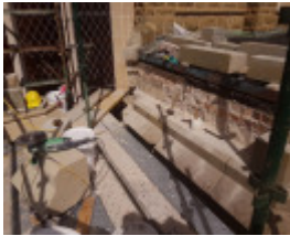
During Photograph - Reference F3890 2015