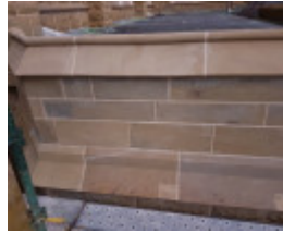
After Photograph - Reference F3890 2016