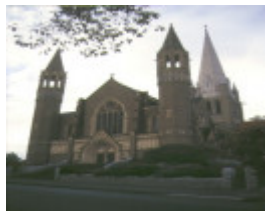
1 sacred heart cathedral bendigo front view apr1997