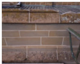
Before Photograph - Reference F3890 2014