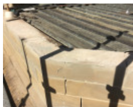
During Photograph - Reference F3890 2015