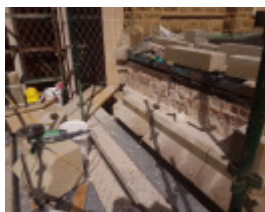
During Photograph - Reference F3890 2015