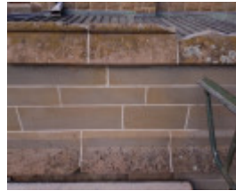
Before Photograph - Reference F3890 2014