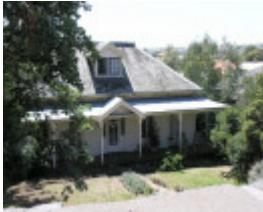
PREFABRICATED RESIDENCE SOHE 2008