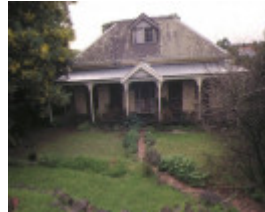
1 prefabricated residence ormond road moonee ponds front view