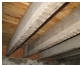
Ground floor from below