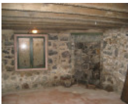
Mt Ridley basement