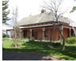
Mt Ridley homestead from north east