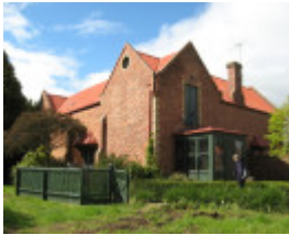
Mt Ridley stable from north west