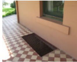
Mt Ridley homestead grill in verandah floor to light cellar