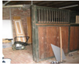
Mt Ridley stable interior