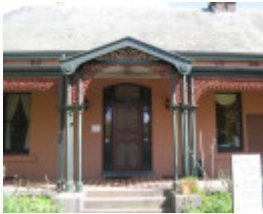
Mt Ridley homestead entrance