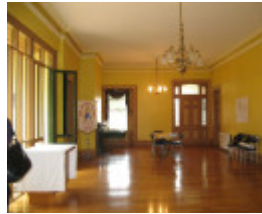
Mt Ridley homestead interior looking towards front door