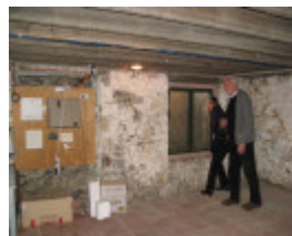
Mt Ridley basement