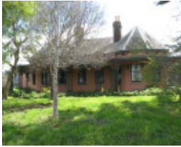
Mt Ridley homestead from south