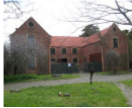
Mt Ridley stable from south