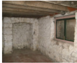
Mt Ridley basement