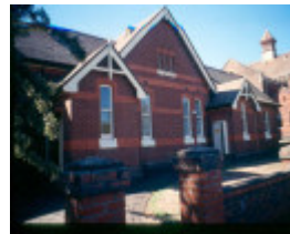
h02034 uniting church auburn sunday school