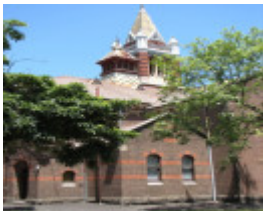
AUBURN UNITING CHURCH COMPLEX SOHE 2008