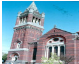
h02034 uniting church auburn h2034