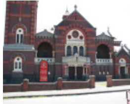
AUBURN UNITING CHURCH COMPLEX SOHE 2008