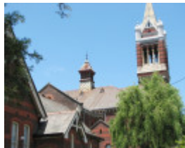
AUBURN UNITING CHURCH COMPLEX SOHE 2008