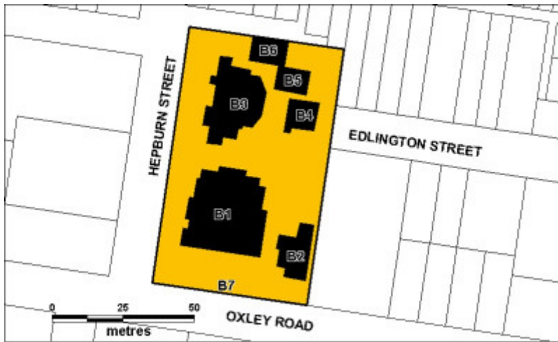
h02034 uniting church auburn h2034 extent april 2003