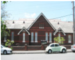
AUBURN UNITING CHURCH COMPLEX SOHE 2008