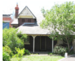
AUBURN UNITING CHURCH COMPLEX SOHE 2008