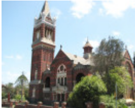
AUBURN UNITING CHURCH COMPLEX SOHE 2008