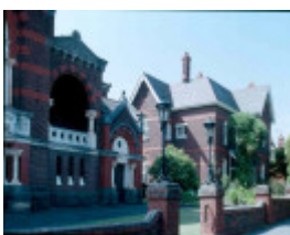
h02034 uniting church auburn manse