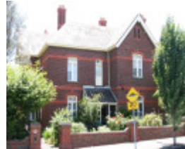
AUBURN UNITING CHURCH COMPLEX SOHE 2008