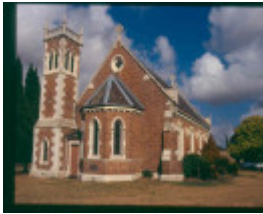
H00225 1 christ church dingley feb 2003