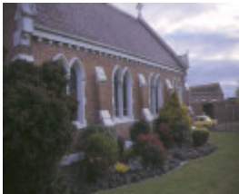
christ church old dandenong road dingley village side view