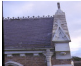
christ church old dandenong road dingley village roof view