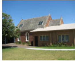
CHRIST CHURCH SOHE 2008