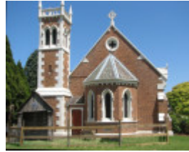
CHRIST CHURCH SOHE 2008