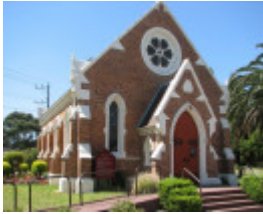
CHRIST CHURCH SOHE 2008