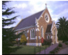
1 christ church old dandenong road dingley village front view