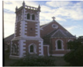
christ church old dandenong road dingley village front elevation